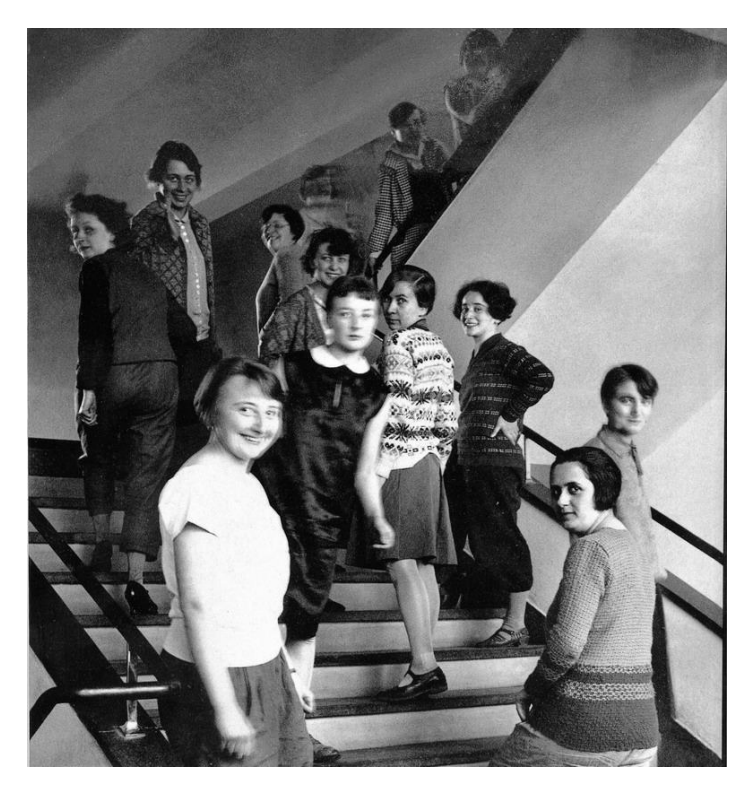
Students at the Bauhaus