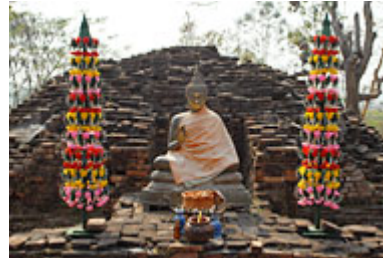
Wat Pa Sak, Chiang Saen, Thailand.

Learn more about the workshop and download the application.