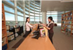
GCI Information Center.

Recently acquired titles in the Conservation Collection in the Research Library at the Getty Research Institute are available to readers on site at the Getty Center. Some materials are available through your library's interlibrary loan service.