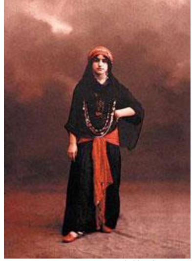
Anonymous, 1930s. AIF/Alfred Pharaon. Copyright © Arab Image Foundation

Find out more about our research on the conservation of photographs.