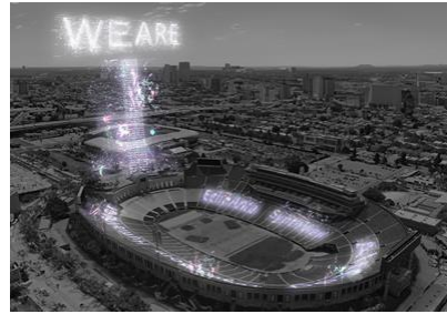
Computer rendering for WE ARE: Explosion Event for PST ART , 2024.

Getty's landmark Southern California arts event, PST ART, returns in September with the theme Art & Science Collide . It kicks off on September 15, 2024, with a newly commissioned daytime fireworks event by artist Cai Guo-Qiang.