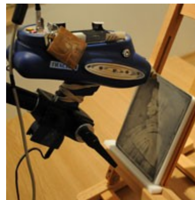
Niépce's photographic plate of Cardinal d'Amboise is examined with X-ray fluorescence spectroscopy. The Royal Photographic Society collection at the National Media Museum.

Learn more about Research on the Conservation of Photographs Project.