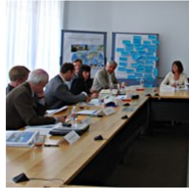
March 2009 experts meeting at the Getty Center.

Learn more about the Historic Cities and Urban Settlements Initiative.