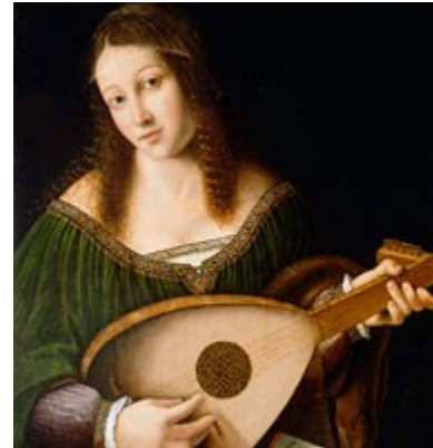
Lady Playing a Lute (detail), Bartolomeo Veneto and Workshop, Italian, about 1530, oil on panel. The J. Paul Getty Museum

Learn more about the Panel Paintings Initiative.