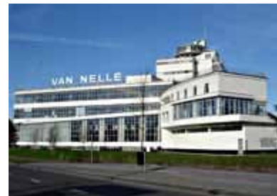
The 1929 Van Nelle Factory in Rotterdam, today the Design Factory, is a successful example of adaptive reuse that incorporates sustainable design principles. Photo: F. Eveleens , ( creative commons license )

Find out more information about this free event and make a reservation online.