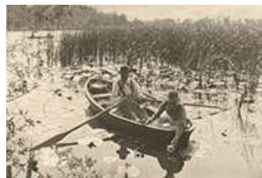
Peter Henry Emerson, Gathering Water-Lilies , 1886 Platinum print, J. Paul Getty Museum.

Learn more about characterizing Asian lacquer at the Getty.