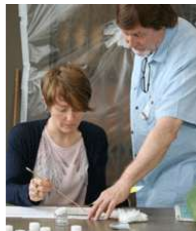
CAPS workshop in 2012 at Tate Britain.

Find out more about CAPS 2013 and apply online.