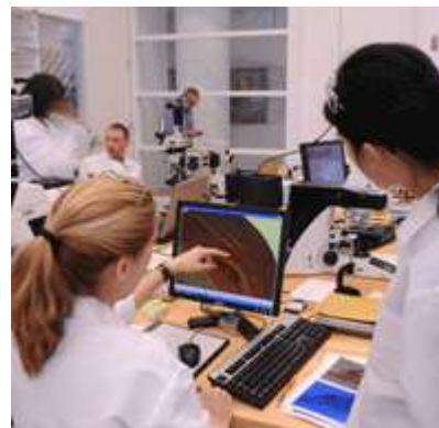
Workshop participants examine an image of a lacquer cross section.