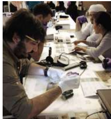
MEPPI workshop in Abu Dhabi.