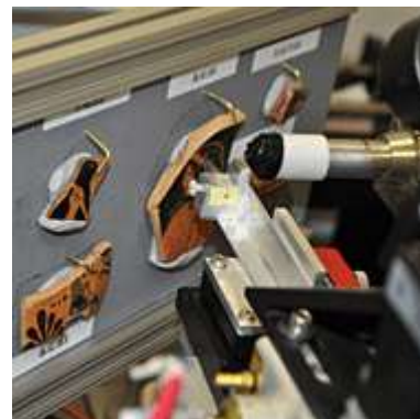
Pottery sherds being analyzed by rapid scanning X-ray fluorescence spectroscopy on beamline 10-2 at the Stanford Synchrotron Radiation Lightsource.

Learn more about the Athenian Pottery Project.