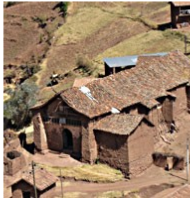
The Church of Kuño Tambo, a 16th-century ecclesiastical building made of mud brick with a truss roof, in Acomayo, Cusco, Peru.

The GCI has joined with the Ministerio de Cultura del Perú, the University of Bath, and the Pontificia Universidad Católica del Perú to form the Seismic Retrofitting Project. The project combines traditional construction techniques and materials with high-tech methodologies to design and test easy-to-implement seismic retrofitting techniques and maintenance programs to improve the structural performance and safety of earthen buildings.