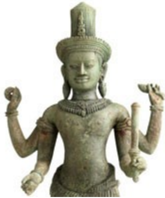
Vishnu-Vasudeva-Nārāyana, Cambodia, detail, Angkor period, late 1000s—about 1150. Bronze, 40 x 18 x 11 cm.