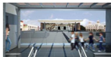
Schematic design of the mural viewing platform. Image: Pugh + Scarpa Architects

In a March 31 event organized by the Amigos de Siqueiros and the Mayor's Office of the City of Los Angeles, the project for the conservation, protection, and display of David Alfaro Siqueiros mural América Tropical was presented to interested stakeholders. The GCI provided an overview of the mural's conservation history to date. Plans for a protective shelter and viewing platform were presented by the architects, Pugh + Scarpa, and the concept for the interpretive center was presented by the exhibit design firm IQMagic.