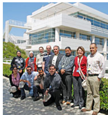
DoA and GCI staff at the Getty Center.