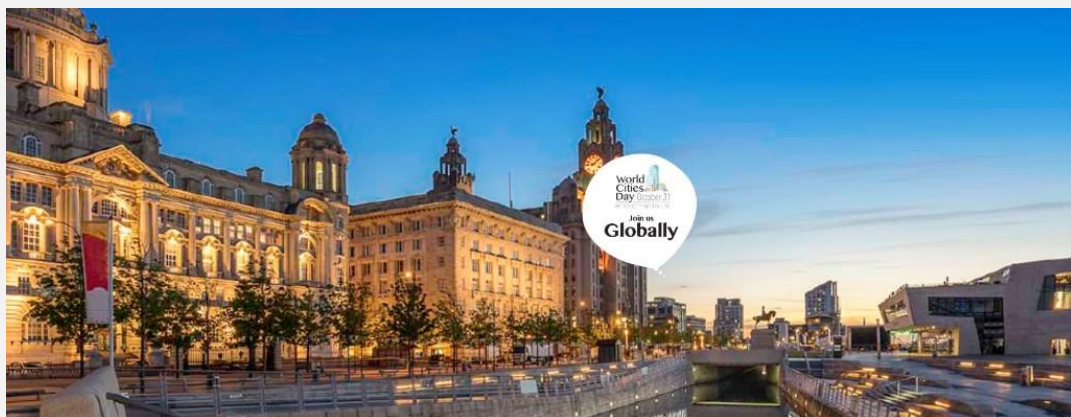
World Cities Day - October 31st, 2018 (31st October, 2018)

World Cities Day aims to promote the international community's interest in global urbanization, enhance cooperation among countries and cities in meeting opportunities and addressing challenges of urbanization, and contribute to sustainable urban development. The overall World Cities Day theme is Better City, Better Life and this