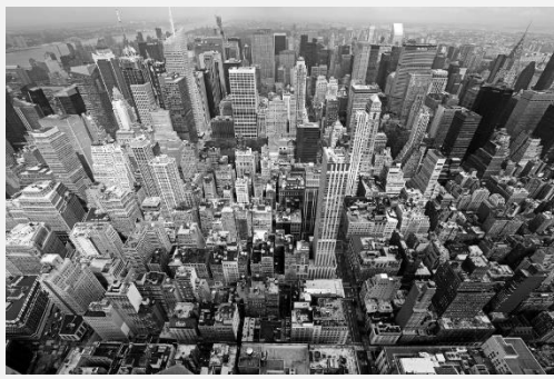
Urbanization: The Gateway to jubilation or destruction?