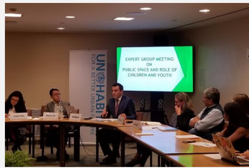
Young People's claim on Public Space